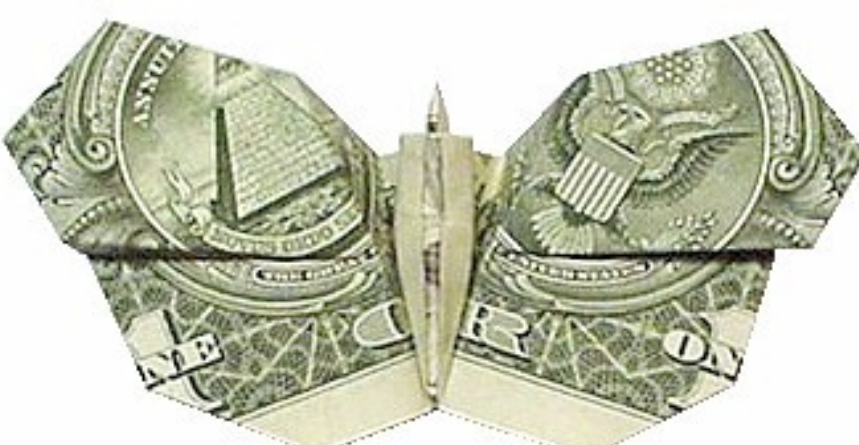
Variation of butterfly

This butterfly was designed using the base of another butterfly by Dokuohtei Nakano. The original butterfly had no tails or wing separation and was made for a 2-1 rectangle. In creating this butterfly I omitted some folds from the original base and added others. The extra paper in a dollar bill allowed for the addition of tails. The end result is a dramatic difference in the look. If you want to see the original butterfly it can be found in the book "Complete Origami" by Eric Kenneway on page 36.